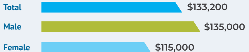
Figure 1 – Annual Base Salary by Gender, 2022 Salary Survey, CMAA. Results based on 846 respondents employed full time in the construction industry as of October 1, 2021, answering.